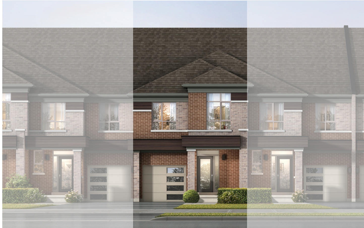
ELEVATION C 2,153 SQ.FT.