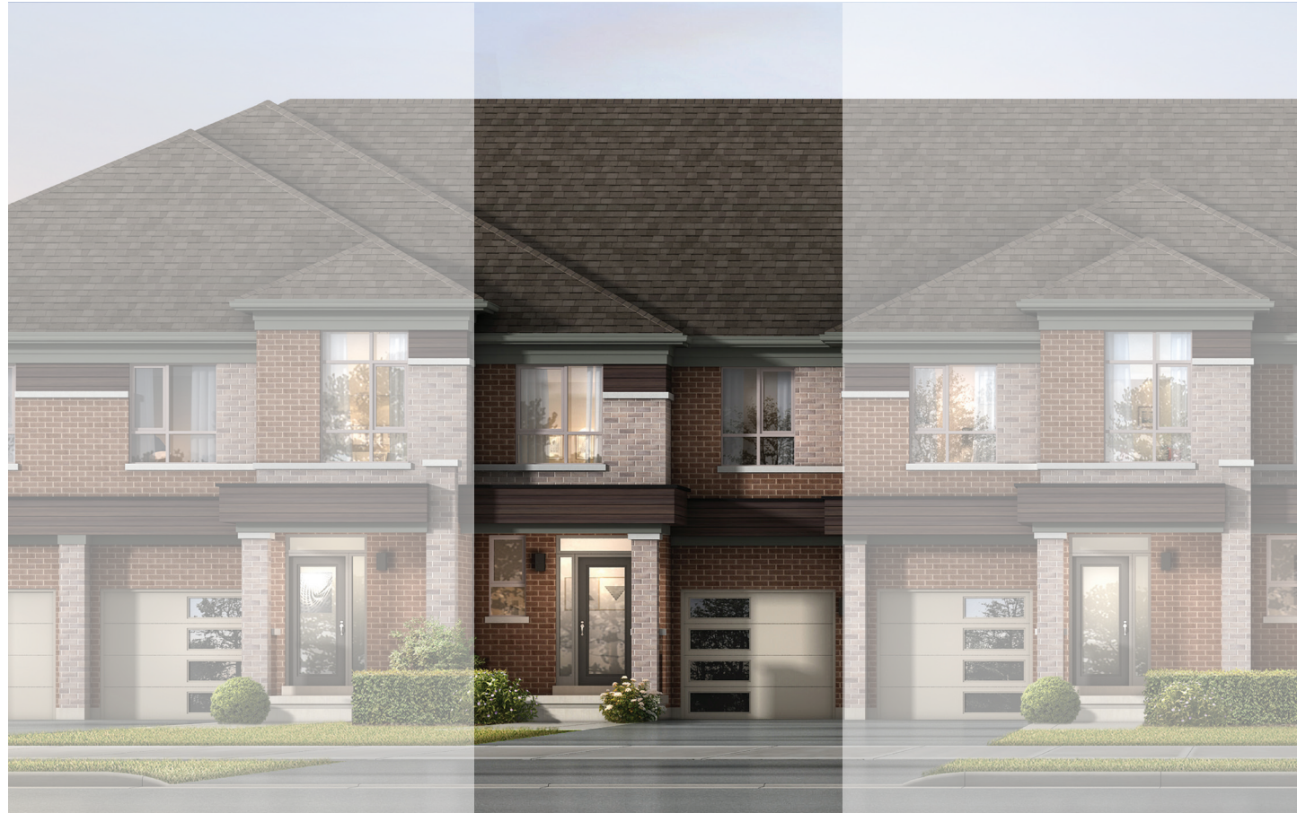
ELEVATION C 1,997 SQ.FT.