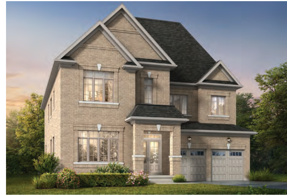
ELEVATION A 3,891 SQ.FT.