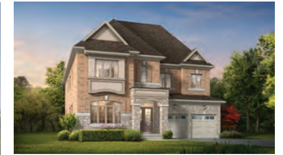
ELEVATION B 3,898 SQ.FT.