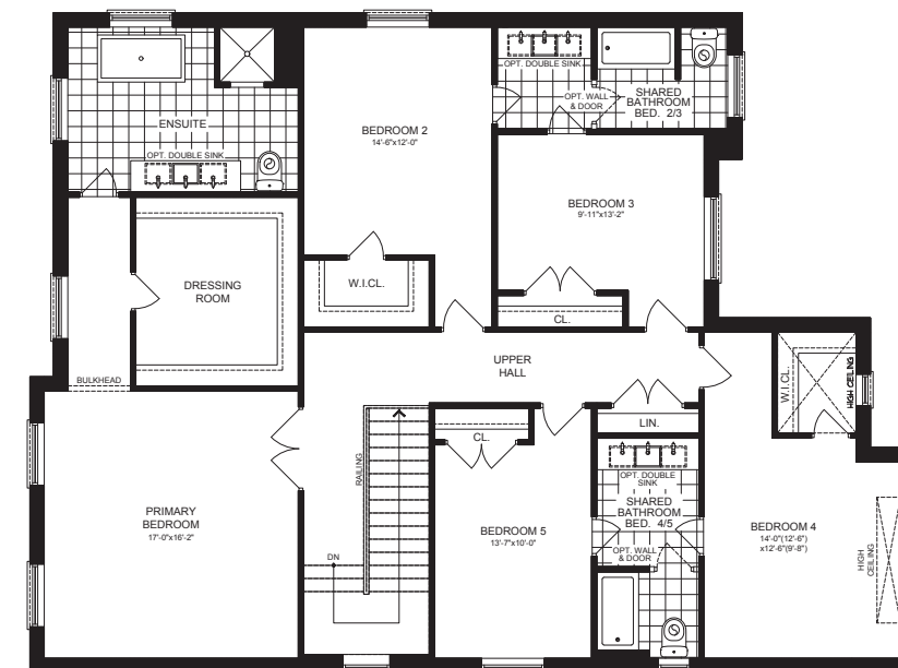
SECOND FLOOR (ELEV. A) - 5 BEDROOM