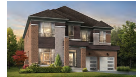
ELEVATION C 3,891 SQ.FT.