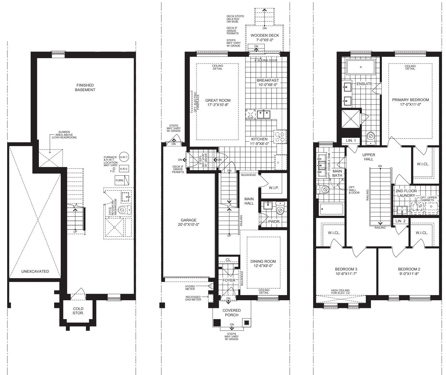
OPT. FINISHED BASEMENT C1