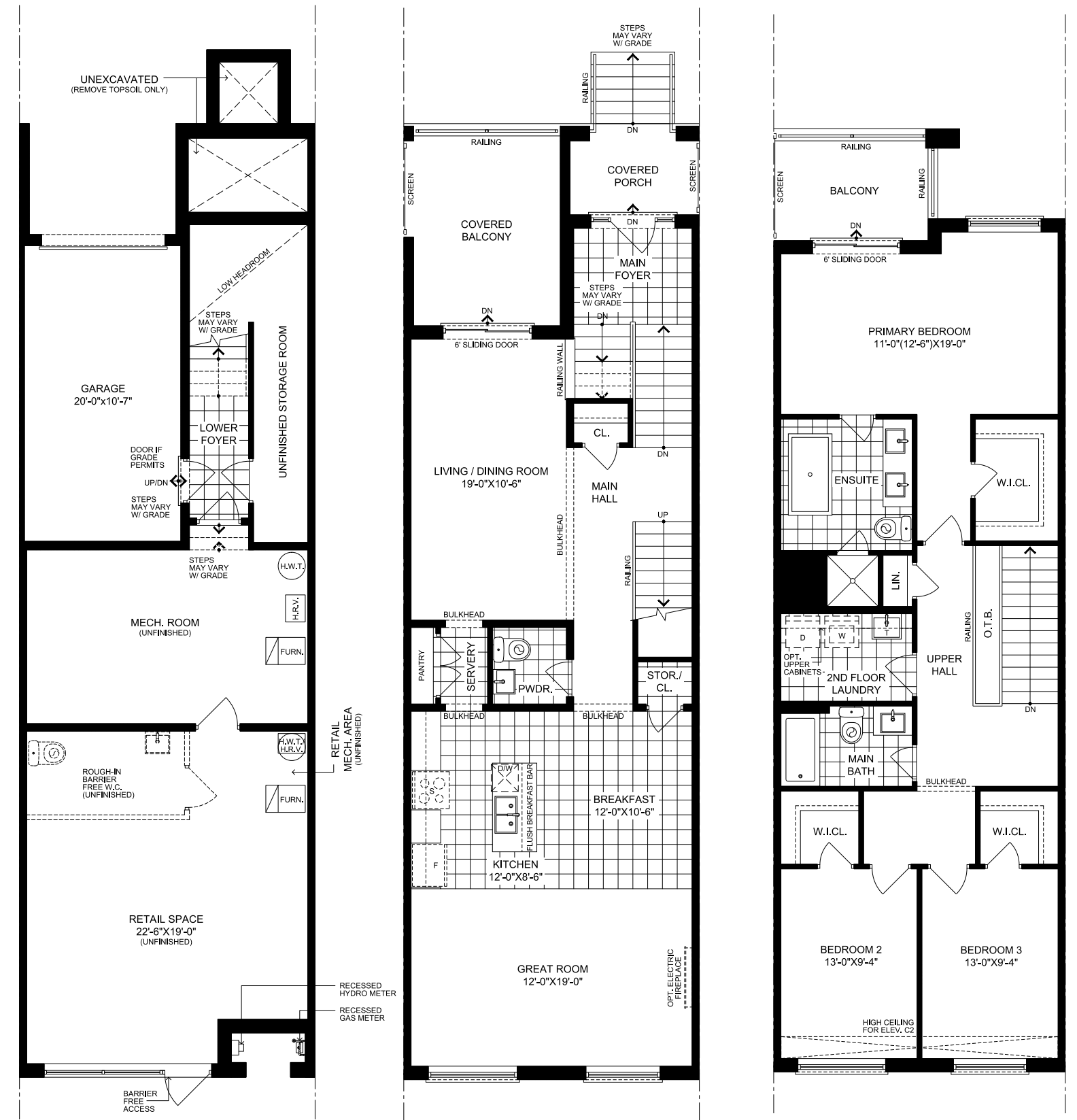
LOWER LEVEL C1